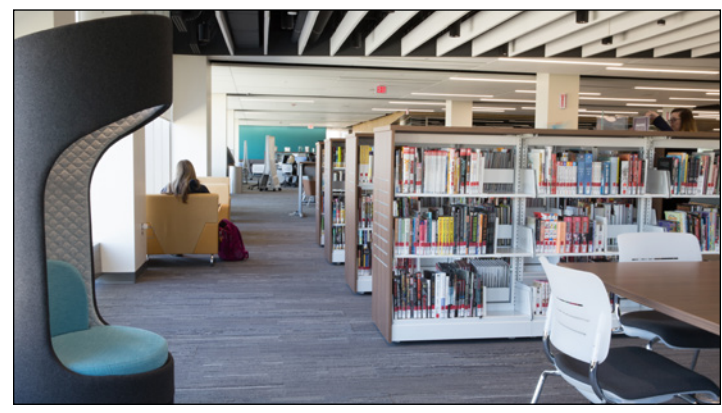
Cantilever Carts with Concealed Casters