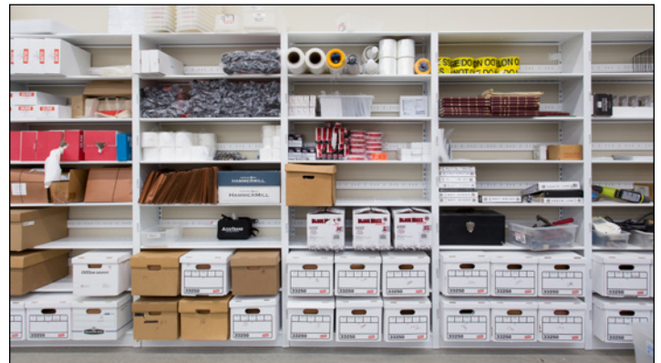
Bulk Storage for Evidence Packaging Supplies

Soon after the move into the new facility, the Lake County Sheriff's Department announced that it was the first, and so far the only, sheriff's office to receive accreditation from the Illinois Law Enforcement Accreditation Program (ILEAP). Evidence management was part of the thorough accreditation process, and the evidence department's careful documentation of chain-of-custody procedures, as well as Spacesaver's evidence storage solutions, contributed to the department's success.