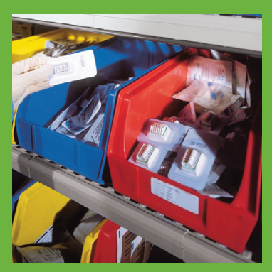
OR Corridor – Sterile Supplies