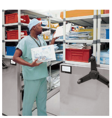
OR Corridor - Sterile Supplies