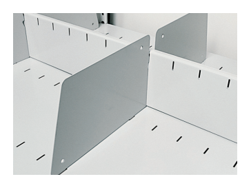
Double-Face Through Shelf with Centerstop Helps separate and contain media being stored.