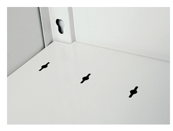
Universal Shelf Unique, patented design allows for attachment of file dividers, bin dividers and divider rods.