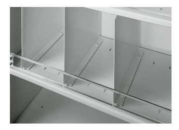
Bin Divider with Acrylic Bin Front Compartmentalizes the storage of three-dimensional objects and other media.