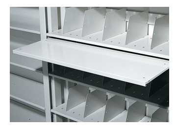
Pull-Out Reference Shelf For convenience in referencing shelved materials. 50 lb. (23 kg) load capacity.