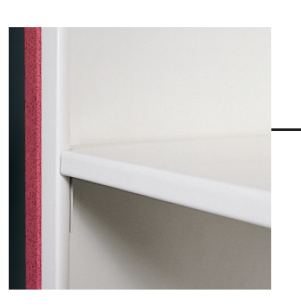
End Angle "L"

18-gauge (1.2 mm) steel uprights offered as a 1" (25 mm) wide "L"-shaped end post or a 2" (51 mm) wide "T"-shaped common post.