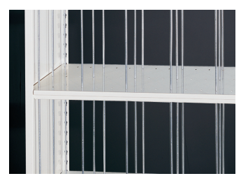
Divider Rods Designed for convenient, compartmentalized storage.