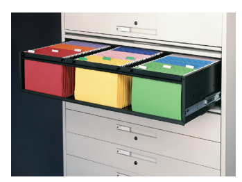
Roll-Out Interior Drawer Can be configured for top-tab hanging folders or open-shelf filing of top or side-tab folders.