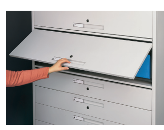
Receding Door Provides for security of materials on open shelving. Can also be used with Roll-Out Interior Drawer.