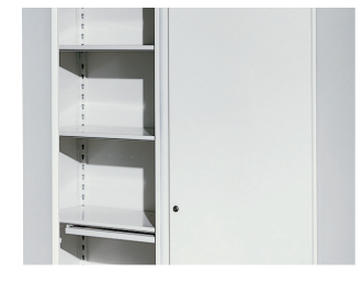
Hinged Doors Provide protection and security for all materials being housed in the lockable shelving cabinet.