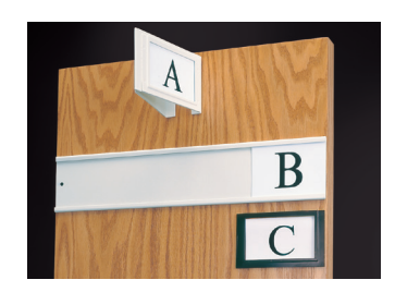
Aisle Identification Options Optional range finders and card holders make locating and reshelving of materials fast and easy.