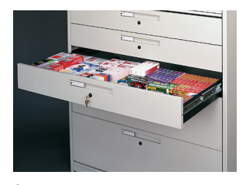
Storage Drawer Accommodates a wide variety of stored media, while providing full accessibility and keyed security. Adjustable bottom dividers available.