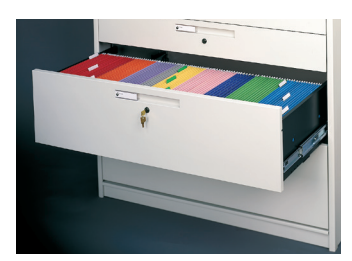
Closed File Drawer Combines security with space efficiency. Can accommodate letter or legal sized files, hanging folders and more. Quickly accessible.